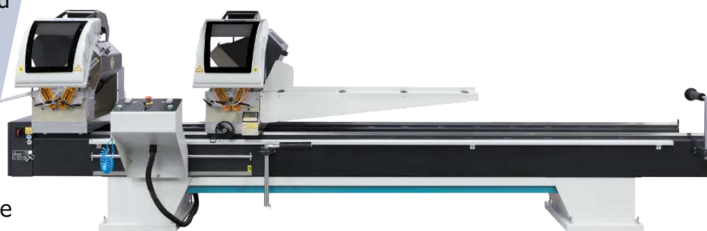
AUTOMATIC DOUBLE HEAD MITER SAW 16-1/2" (420 MM)